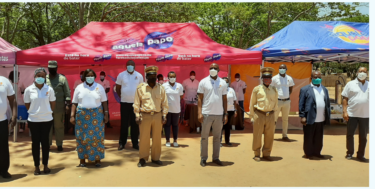
SMC launch event, Mozambique

Malaria Consortium also conducted mixedmethods research on IPC compliance among community distributors during SMC in 2020, including structured observations.<sup>[17]</sup> The preliminary results suggest mixed adherence to the COVID-19 measures. Results will be published in mid-2021 and are not included in this learning