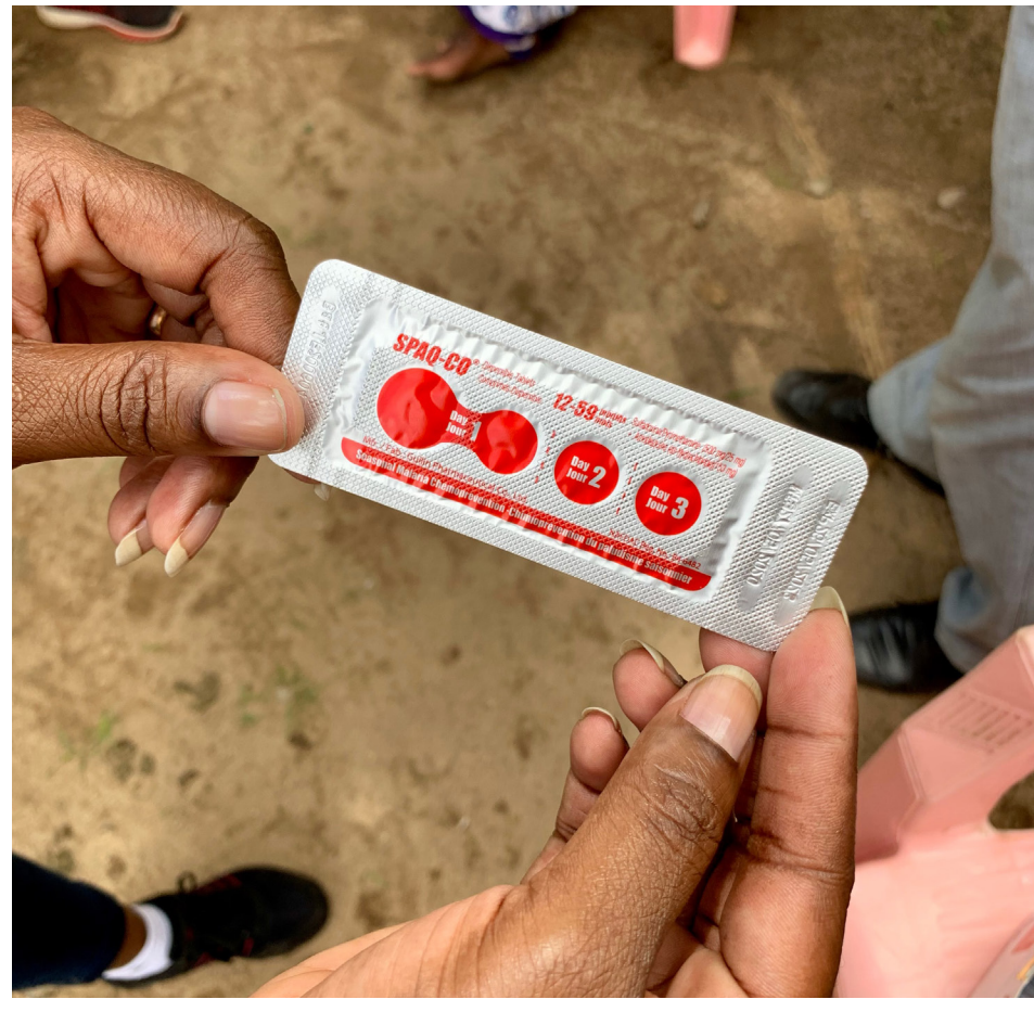
A blister pack containing SPAQ medication. A full course of SPAQ confers a high degree of protection from malaria infection for approximately 28 days.

The pandemic has underlined the need to increase the use of digital tools to strengthen SMC delivery.