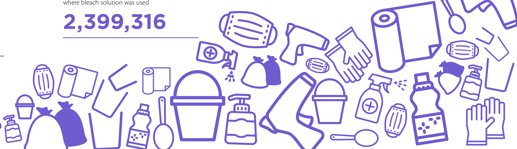
Figure 2: Essential commodities we procured with philanthropic funding in 2020 to help prevent COVID-19 transmission

For wiping down hard surfaces and SMC tools where bleach solution was used