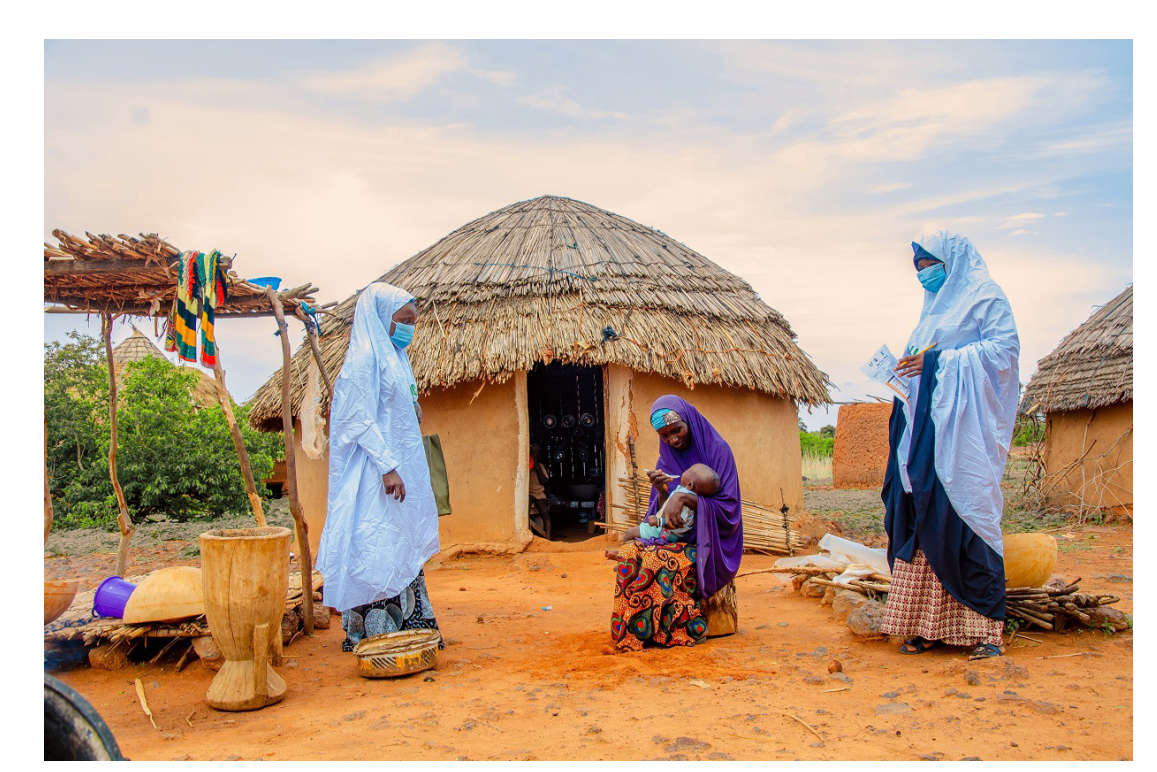
A caregiver in a Fulani settlement in Sokoto state, Nigeria, administers SPAQ to her child under the supervision of community distributors. This is known as DOT

examples from the past were drawn upon; for example, the measures followed during the Ebola outbreak with the messaging being similar 'stop people from dying', push that message. The guidance was evidence based and open to everyone. This has to be translated into different languages and very specific, reiterated at the end of each cycle. It was important to disseminate COVID-19 health messaging at all levels.